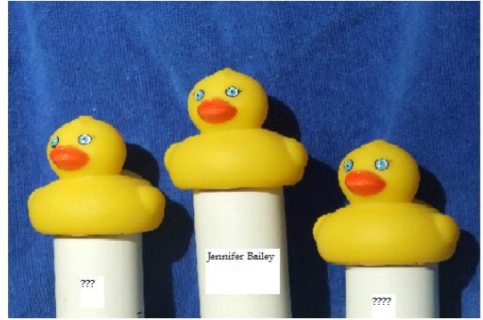
The winning ducks.